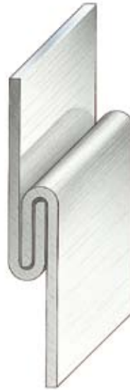
GA WP1 8.7mm wall to panel fixing distance