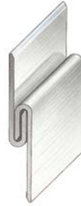
GA WP2 5.2mm wall to panel fixing distance